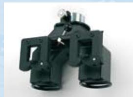
Double outlet with bag holder.